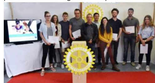
Students of the highschool of Works of Arts awarded Manual Labour Excellency Award by Rotary and Banque Populaire.