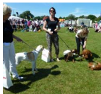
The popular Fun Dog Show returns supported by Canine Partners Assistance Dogs.