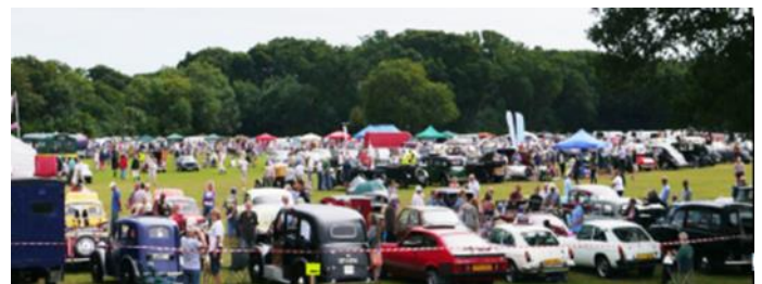
Classic Car show

Now in it's 19th year Woodside Park was once again host to the fantastic Classic Car Show with space for 250 cars.