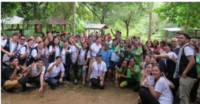
Members of the Rotary Club of Sampaguita Grace Park and the Rotaract clubs of University of the East Caloocan and University of Caloocan City.

Through a partnership with Liter of Light, BYKA group and 8990