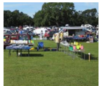
Family Car Boot Sale