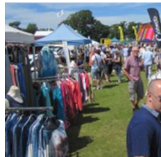
Trade and Charity stalls